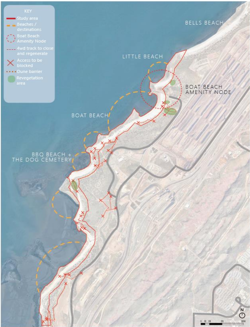
Figure 34. Regeneration plan - Scale: 1:15,000 at A3